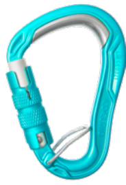
HMS Bulletproof Triple FG 73728