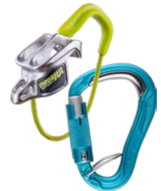
Mega Jul Sport Belay Kit Bulletproof Triple 73735