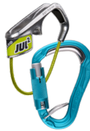
Jul 2 Belay Kit Bulletproof Triple 73732