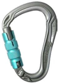
HMS Bulletproof Triple 73727

The precautionary call for a safety check concerns both carabiner models with manufacturing codes 2018 01 and 2018 02: